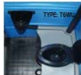
PORTABLE TOILET, MODEL T6W & T6WU(with Urinal)