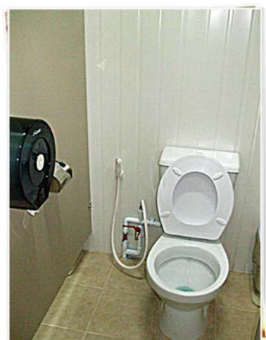
SITTING TYPE BOWL WITH FLUSH