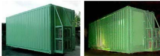
OFF-SHORE LER CONTAINER M41, M42, M43, M44