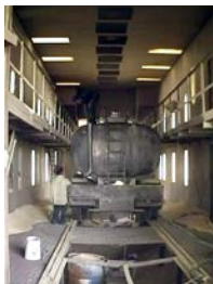
Air blast room