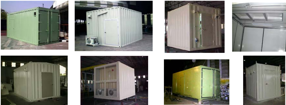
SWITCHING GEAR/ SUB-STATION