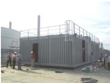
M46-M40 Container for VETCO