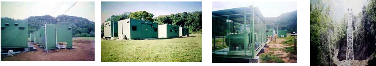
FIXED STATION RADAR SURVEILLANCE & TOWER