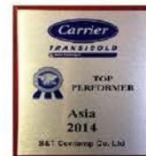
Presented at the Yr. 2014 Bi-Annual Asia-Pacific Regional Meeting, 4-5 September 2014, Xiamen, R.O.C.