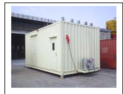
SWITCHING GEAR CONTAINER