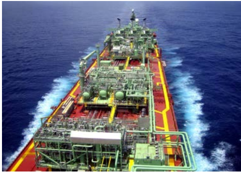
FPSO Chinguetti 2006