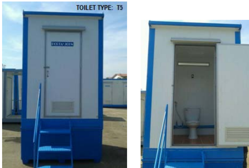
PORTABLE TOILET, MODEL T5