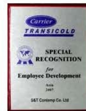
Presented at the Yr2007 Asia-Pacific: Service Center Meeting, Xi'an, R.O.C., 18-19 Oct. 2007.

Yr. 2007 Top Performance Award For Employee Development achieved by S&T Contemp Co.,Ltd.