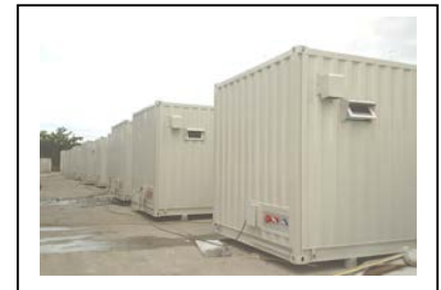
ABB-SUBSTATION FOR P.E.A.