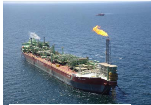
Berge Helene Fly by 2006