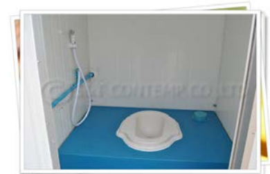
SQUAT TYPE BOWL