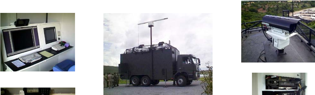
MOBILE RADAR SURVEILLANCE TRUCK